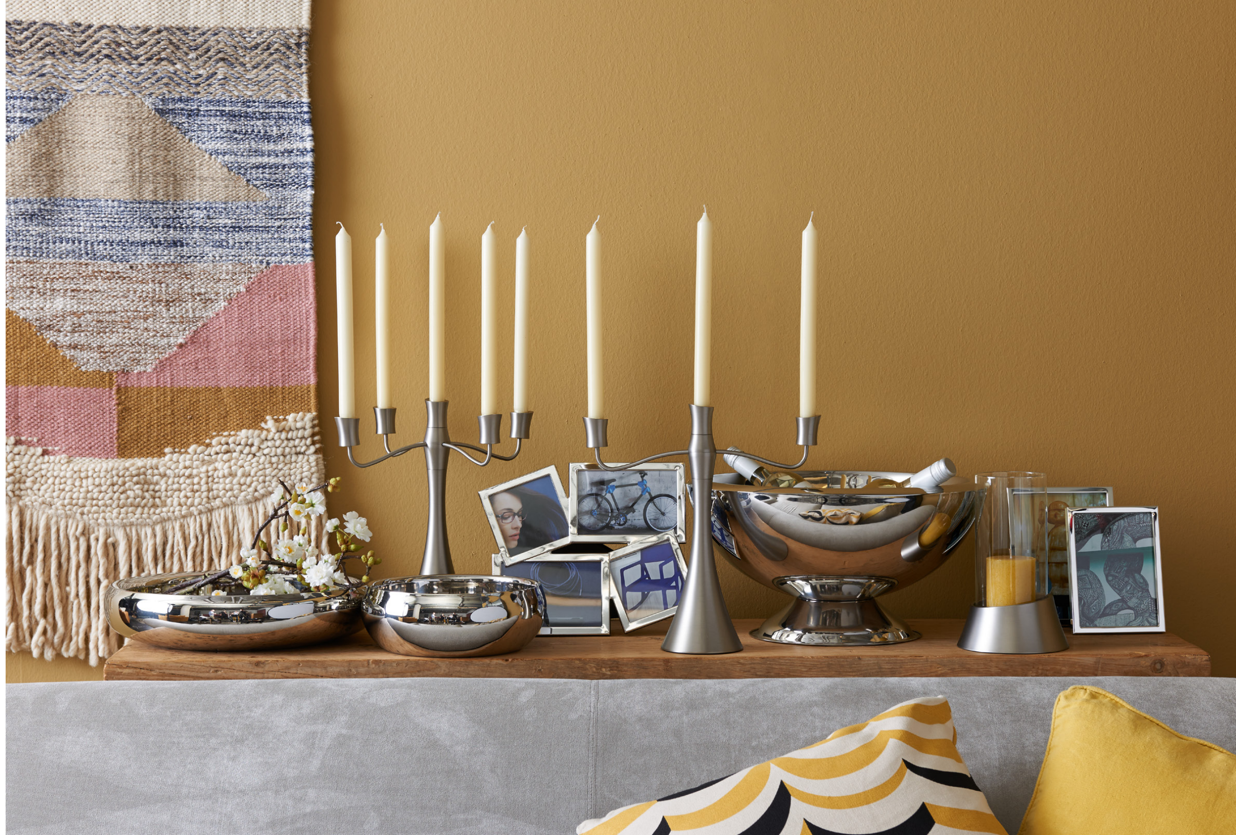
Bowl Deco double walled • Candelabra Monte 5 branches • Bowl Largo double walled • Photo frame Oregon • Candelabra Monte 3 branches • Champagne bowl double walled • Hurricane lamp Monte • photo frame Madeira