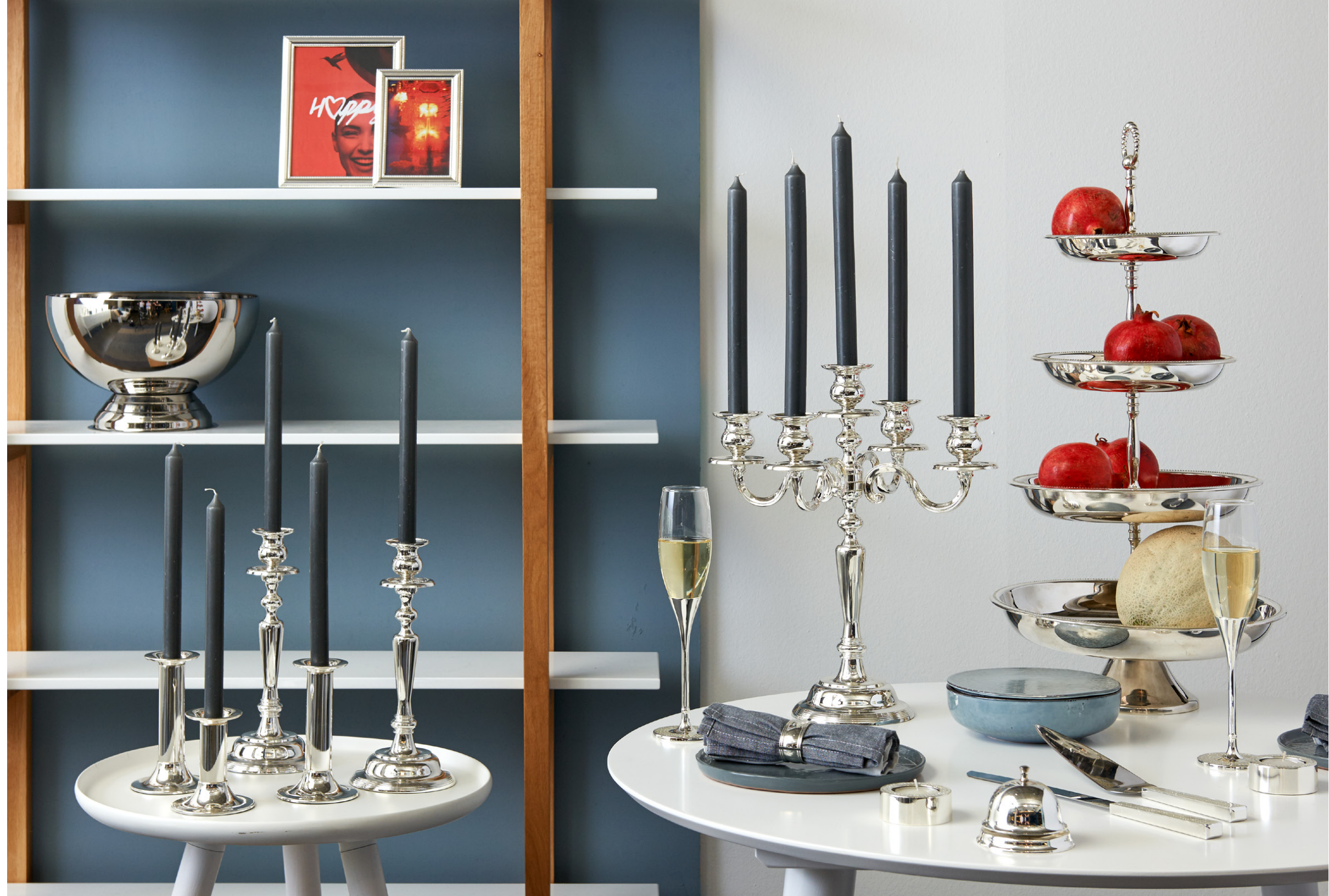
Photo frame Pearl • Champagne bowl • Candle stick Tube • Candle stick Grazia • Candelabra Grazia 5 branches • Champagne glasses Silver Diamond • Serving stand Pearl • Napkin rings Oval • Tea light holder Silver Diamond • Table bell